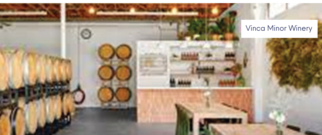
Vinca Minor Winery