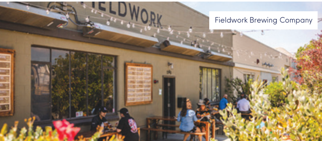
Fieldwork Brewing Company