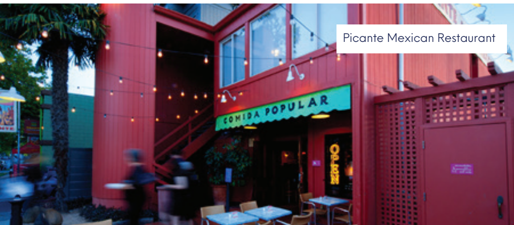
Picante Mexican Restaurant