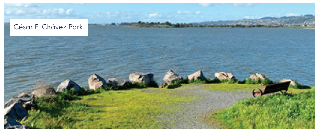
César E. Chávez Park