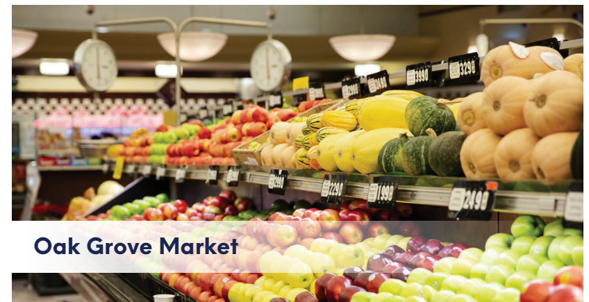
Oak Grove Market