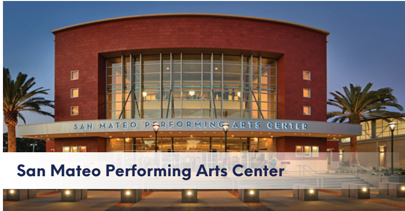
San Mateo Performing Arts Center