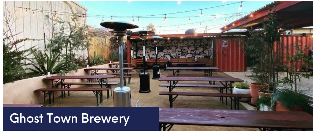
Ghost Town Brewery